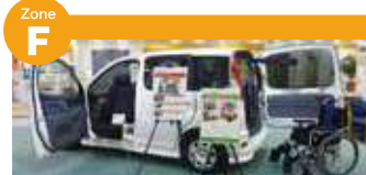
A display of mobility devices such as assistive vehicles and silver cars that safely broaden the mobility field, as well as an exhibition related to disaster prevention.