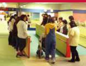
Experience the comfort and functionality of an electric wheelchair.