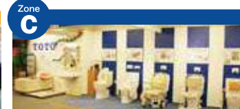
Active lifestyles - essential to good health. Products to assist a healthy lifestyle and a variety of products related to nursing care.