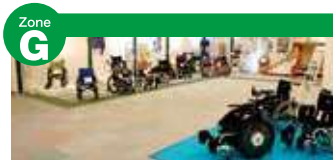
A variety of wheelchairs are displayed and you can test a wheelchair at the 'Wheelchair Trial Course' in the zone.