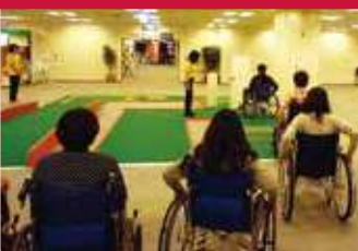
Experience opening and closing doors and other obstacles while in a wheelchair.