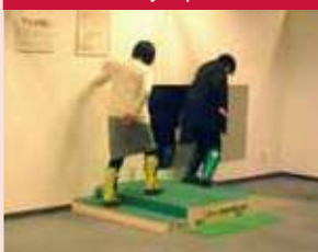
Put on the equipment and experience what it's like to be an elderly.