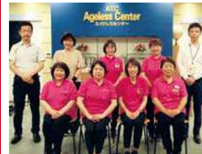
We are the Ageless Center floor staff.

During the exhibition, our floor staff will provide information to guests on behalf of the exhibiting companies.